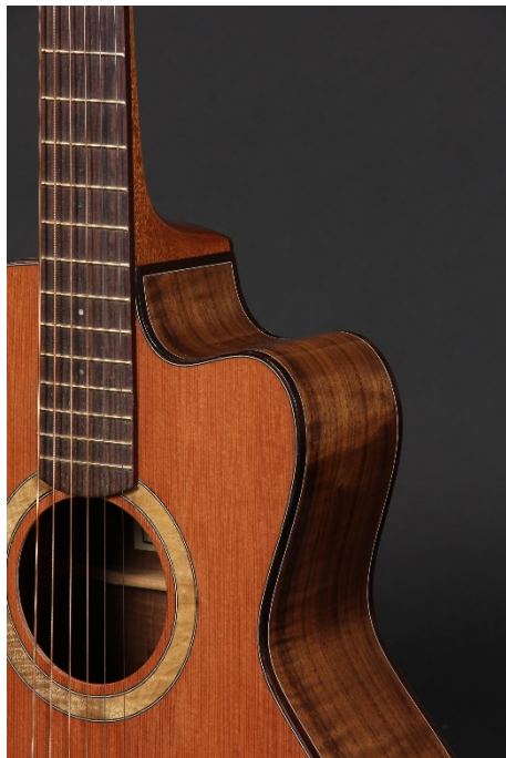
1A properly applied Polyester and urethane finish looks anything but "plastic". Photo and guitar by the author

1950-1960 – The introduction of Electric guitars opened more possibilities with finishes, mainly because many are solid paint colors. Fender used nitrocellulose lacquer in the early days and in the 1960's began experimenting with faster ways to fill the deep grain on woods like ash. Conventional grain filling techniques using oil-based grain fillers shrink back and the exposed grain looks unattractive on a solid color. (We now affectionally call shrink back an aged or "reliced" effect these days). To alleviate this Fender started using non shrinking grain fillers, the most notorious one called FullerPlast, a catalyzed varnish made by Fuller Obrien paint company. The 1960's also saw the use of a type of lacquer used in the auto industry called acrylic lacquer, which does not yellow as badly as nitrocellulose and looks better with white and pastel finish colors. You can see the influence of the auto industry on the palette of paint colors used on guitars during this period. Sea Foam Green and Fiesta Red are well known car colors from the 1960's. Urethane also saw limited use, but for the most part both Fender and Gibson continued to use nitrocellulose lacquer, particularly for the topcoats.