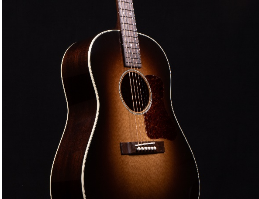
A catalyzed urethane finish on this Bourgeois Guitar has the aesthetics of lacquer but in a more durable finish.

Lacquer continues to be the all-around favorite among companies like Martin and Gibson as well as the smaller companies like Santa Cruz and Collings. Back in the 1990's we were told that lacquer would eventually be outlawed but it has not, mostly because manufacturers have come up with low-VOC versions. Taylor uses an all-UV finish and waterborne paint for some solid color guitars. Martin still uses an all-lacquer finish but uses a catalyzed varnish product on some necks. A lot of companies like PRS, Collings and Santa Cruz use a catalyzed product or polyester for the grain filler with a lacquer topcoat because of its looks and repairability as well as customer demand. At Collings you can even order your custom model with varnish!