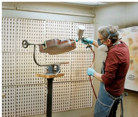
The author applying clear finish in a spray booth.

No reproduction without written permission from the Author