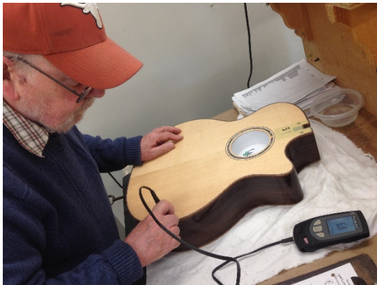
Checking mil thickness at Martin.

Most guitar-makers, whether big or small, agree that the finish should be kept as thin as possible on the soundboard. This allows the top to move and transmit vibrations as efficiently as possible. At factories, monitoring the thickness of the soundboard finish is done with measuring equipment constantly to maintain a certain mil thickness. A mil is 1/1000 inch. Most everyone, large or small, strives for a mil thickness below 5 mil after buffing on soundboards. Some companies, such as Bourgeois are hitting below 5 mil on his aged tone models, using a catalyzed finish.