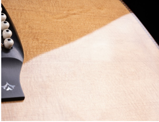
Although nuances are difficult to photograph, this "aged tone" closeup shows a fully buffed gloss soundboard that still shows plenty of grain definition, usually only found on a lacquer finish.