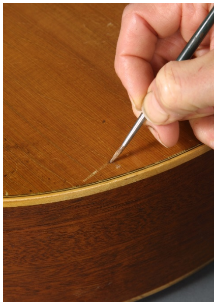
A big feature of lacquer is repairability. Here, thinned lacquer is applied to a lacquer finish to repair a scratch.

1925-1930 - Nitrocellulose Lacquer is introduced. Nitrocellulose lacquer is a synthetic resin made by chemically treating cotton. The resin is then soluble in solvents like acetone and butyl acetate. It is a very brittle resin so a plasticizer chemical is added to make it flexible so that it can “move” when the wood shrinks and expands with changes in Humidity. Nitrocellulose lacquers dry to the touch within minutes and can be recoated in as little as 30 minutes, so it is very production friendly. It also rubs out very well and can be repaired later with no evidence by simply applying more lacquer. It is the latter feature that makes it continue to this day as the finish of choice for the big companies except Taylor.