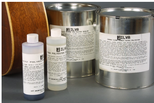
Polyester Sealer and Topcoat. Both are very tough and non-shrinking.

Urethane chemistry was discovered by Otto Bayer in the 1930's but never came into industrial or commercial use until the 1950's. There are many distinct types of urethanes, everything from oil-based polyurethane (a type of varnish) to adhesives and foam insulation, but the one that we are referring to in musical instrument finishing is called two-component urethane (catalyzed urethane is also used albeit incorrectly). Urethane is very tough, hard, and impervious to solvents. It's what is on your car. It first started appearing on Asian import guitars in the 1960's and 70's and never gained traction until it was used extensively by PRS guitars and others in the