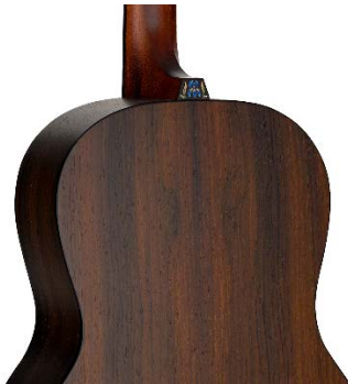
This closeup of the back of an Iris guitar shows open grain and a satin finish.

French Polish is still used to a considerable extent as it is low odor and non-hazardous and does not require a spray booth. Many classical builders use it exclusively.