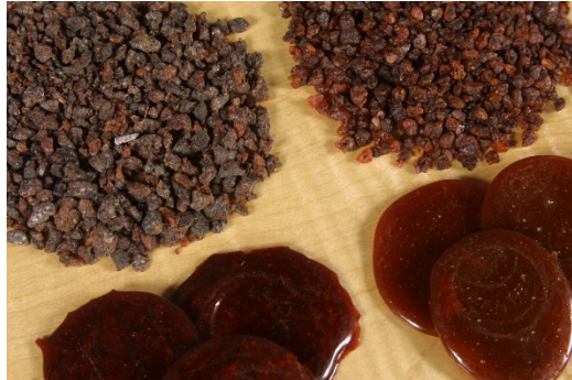
Unrefined Shellac - Seedlac (top) and Buttonlac (bottom)

Shellac is an animal by-product of a small insect native to India and parts of Thailand. It would belong in the same group as spirit varnish above. Shellac is simply the lac resin dissolved in alcohol, typically methanol, ethanol, or isopropanol. Ethanol is the preferred solvent, but because it is the same product as liquor, pure ethanol is taxed. Denatured alcohol was developed in the early 1900's to get around this. It's ethanol with a fair amount of other chemicals like methanol to make it unfit to drink. Shellac finishes have been widely used on musical instruments for centuries and continue to be used in a process called